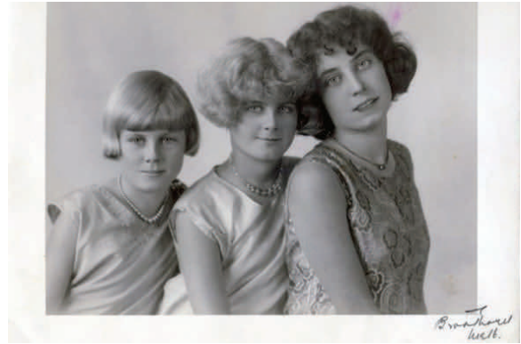
The Parker Girls, circa 1932