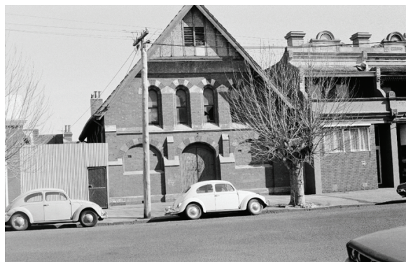
Former Wesleyan Chapel/Methodist Church, 282 Richardson St in the 1970s

probable that the church authorities would re-erect the belfry or replace it with another tower. The church had been erected 20 years. During the past two decades the number of local worshippers had increased to an extent that to accommodate them all a larger place of worship would be necessary. Consequently the church council was now, and had been for some time, giving consideration to a proposal to erect another church on the same side of Richardson street, but on land situated about the middle of the next block beyond Armstrong street. This site, now covered with residences, the church council had already acquired. It was expected that within 12 months the work of building a new church would be commenced. When the new church is erected the present one is to be altered for use as a school.