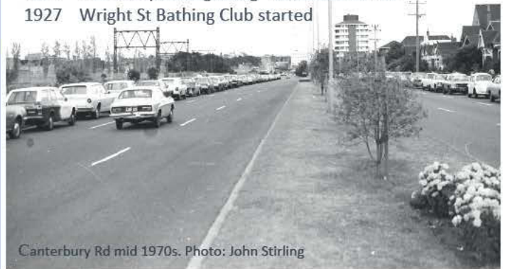
Canterbury Rd mid 1970s.