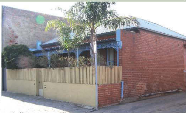
141 Ashworth St

The last few years have seen a rationalisation of police stations across the state. But at one stage, and for many years there appears to have been a police station, or what might have been a sort of sub-station, in Middle Park. Strangely the address of the police station appears to shift over the years, which suggests it was always a small office, and perhaps a rented facility. Several sites are noted in Sands & McDougall as being, for a time, a police station (with the name of the officer-in-charge noted), suggesting that he (it was always he) lived on the premises. No 259 Richardson St is one such site though, given that it has unusual architectural qualities, and two front entrances, it suggests it was either purpose built or converted for use to enable the front rooms to be used as the police office.