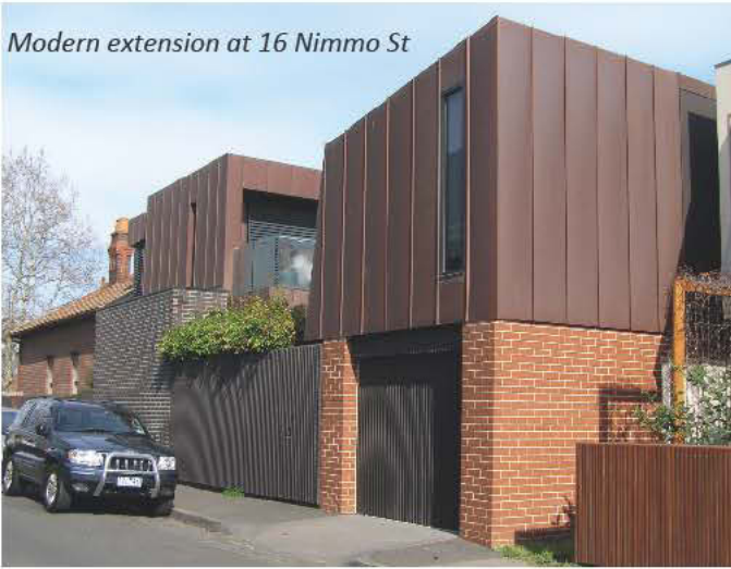
Modern extension at 16 Nimmo St

While most of these extensions are not generally visible to passers-by (a point of emphasis in planning permits), there are several on corner sites which make bold statements. Some of the more bold, postmodern statements can, for example, be seen in the recent extensions to the former 1920s shop-house on the corner of Park Rd and Fraser St where the extension is designed to be almost a form of urban sculpture, making no pretence of being old and original. The extension of the corner NW of Page and Armstrong St is similarly bold, as is that at 16 Nimmo St and. A common theme in these extensions appears to be the use of metal as a facing, a distinct shift from the traditional materials of brick or wood.