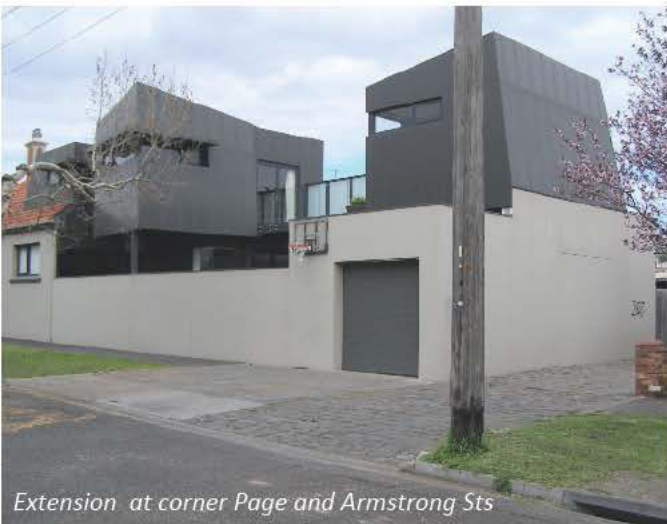
Extension at corner Page and Armstrong Sts

While most of these extensions are not generally visible to passers-by (a point of emphasis in planning permits), there are several on corner sites which make bold statements. Some of the more bold, postmodern statements can, for example, be seen in the recent extensions to the former 1920s shop-house on the corner of Park Rd and Fraser St where the extension is designed to be almost a form of urban sculpture, making no pretence of being old and original. The extension of the corner NW of Page and Armstrong St is similarly bold, as is that at 16 Nimmo St and. A common theme in these extensions appears to be the use of metal as a facing, a distinct shift from the traditional materials of brick or wood.