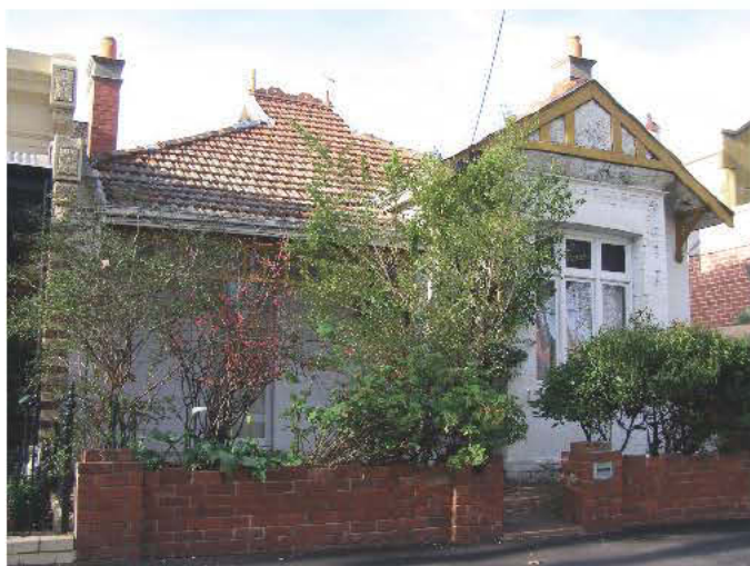
Former police station at 259 Richardson St