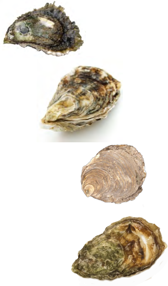
Top to bottom: Sydney rock oyster Stewart Island oyster Australian flat oyster Pacific oyster

The predominant oysters bought from the South Melbourne Market are cultivated Pacific Oysters, a widely cultivated species introduced to Australia and other places from Japan.