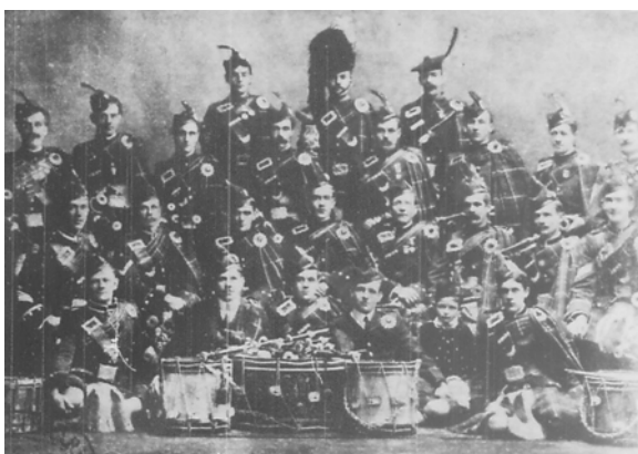
South and Port Melbourne Thistle Society's Pipe Band, 1912