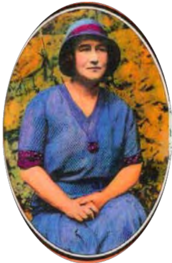
Dame Annie Jean Macnamara DBE

In 1931 Jean Macnamara received a Rockefeller Foundation scholarship which supported her travel to Britain and the United States to study poliomyelitis. She purchased the