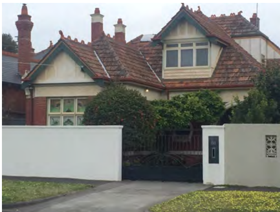
88 Nimmo Street today

On his retirement as mayor in September 1919, generous praise was forthcoming from his fellow councillors on his splendid service to the municipality. The accompanying article from Emerald Hill's newspaper The Record of 30 August 1919 shows that that praise was also felt by others and the South and Port Melbourne Thistle Society's Combined Pipe Band were moved to demonstrate it.